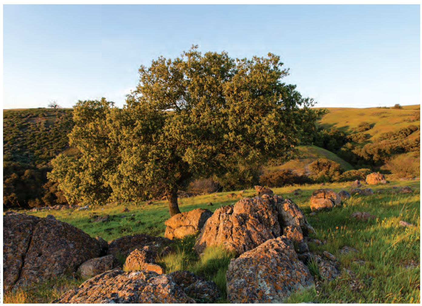
Conservation along Coyote Ridge provides an opportunity to close critical gaps between parks and protected areas, creating the possibility of an interconnected landscape covering 500,000 acres extending from the Coyote Creek Parkway to Mount Hamilton and Henry Coe State Park.

Coyote Ridge extends along the east side of the Santa Clara Valley between San Jose and Morgan Hill. Highly visible from southern San Jose and the Highway 101 corridor throughout Coyote Valley, the dramatic ridge extends 1,400 feet above the valley floor. A number of creeks originate on Coyote Ridge, and ultimately feed into Coyote Creek, an important steelhead steam. Coyote Ridge encompasses extensive serpentine grasslands and oak woodlands, which