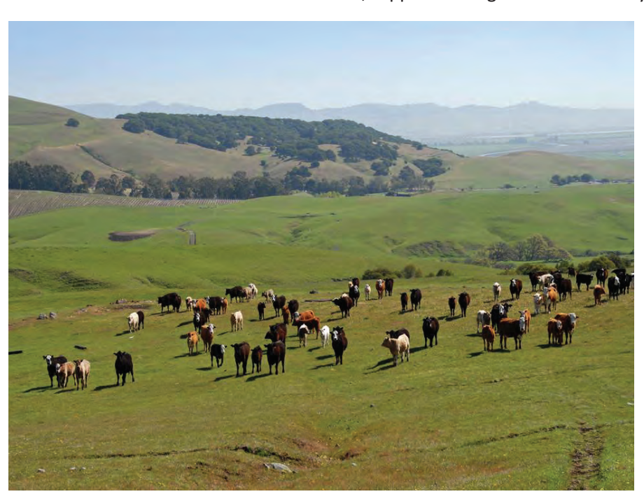
The Authority and other members of the Upper Alameda Creek Watershed Partnership are working to protect and restore the landscape of the South Bay's biggest watershed, including promoting conservation incentives for landowners.

By protecting the integrity of the watershed through land conservation and careful land management, the Partnership is helping maintain the green infrastructure that naturally supplies much of the region's high-quality drinking water. This watershed-based approach to conservation greatly reduces the need for downstream flood protection and water treatment facilities, supports the agricultural economy, and will protect a beautiful expanse