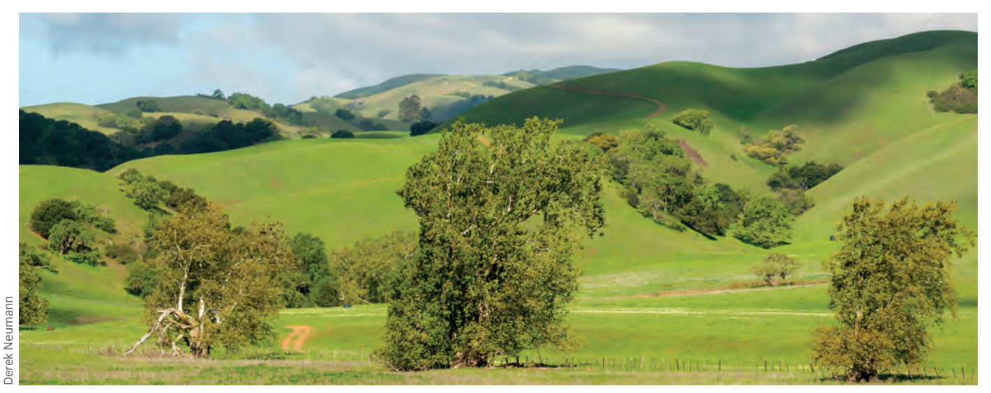
The Sargent Hills rise steeply from some of the County's most productive commercial farmland. The area includes a diverse and extensive landscape with large ranches and critical habitat.

Because there are relatively few landowners in this extensive area, the Sargent Hills provide unique opportunities for conservation. They figure prominently in a number of organizations' conservation visions: they are included in the Valley Habitat Plan as a top priority for land protection; and portions of the Sargent Hills are included in the County General Plan , Countywide Trails Master Plan , and the County Park Acquisition Plan . The Land Trust of Santa Cruz County and their partners are actively working in this area to protect habitat, watershed integrity, and working timberlands, and a consortium of conservation organizations including the Peninsula Open Space Trust and The Nature Conservancy is working to protect this area as part of the critical linkage to the Diablo Range. The Sargent Hills represent an opportunity for the Authority to work with these and other partners to protect vital rangelands and critical habitat. Land protection in this area could provide new opportunities for public access and recreation like the Bay Area Ridge Trail – with views extending from the Monterey Bay to the Diablo Range – in a large landscape minutes from Gilroy and south County communities.