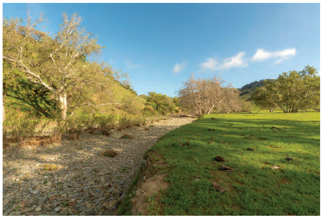
Pacheco Creek runs through a scenic valley that includes small farms and large ranches. Its significant natural resource values include California Tiger Salamander and steelhead habitat.

Given the distance of this remote area from the Authority's land management and operations facilities, the Authority will most likely play a supporting role in land conservation efforts in Pacheco Creek. While there may be opportunities to partner with other public agencies to close gaps between Henry Coe State Park and Rancho Cañada de los Osos Ecological Preserve, this landscape is ideal for use of conservation easements and stewardship incentives. These conservation tools allow farm and rangeland to remain in private ownership, while ensuring protection of their conservation values and providing funding for voluntary habitat restoration projects. Key conservation partners in this area include the Natural Resources Conservation Service, the Loma Prieta Resource Conservation District, Valley Habitat Agency, California State Parks, California Department of Fish and Wildlife, County Parks and Recreation, Pacheco Pass Water District, and The Nature Conservancy.