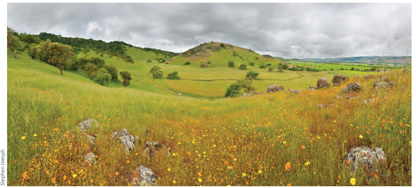
Coyote Valley includes perhaps the most important conservation opportunities within the Open Space Authority's jurisdiction, with outstanding habitat and critical linkages, some of the area's last prime farmland, and an open space greenbelt between San Jose and Morgan Hill.

The conservation values of Coyote Valley are myriad and unparalleled – perhaps greater than they are anywhere else within the Open Space Authority's jurisdiction. The 7,400-acre Coyote Valley, stretching from San Jose south to Morgan Hill, includes some of the last remaining contiguous, prime farmland in a region heralded for its agricultural heritage. In 2012, Sustainable Agriculture Education (SAGE) and the California Coastal Conservancy published a feasibility study, Coyote Valley: Sustaining Agriculture and Conservation , investigating the future of sustained agricultural production and open space conservation in the Valley (SAGE 2012). The study highlighted the multiple values of Coyote Valley, including valuable farmland, critical habitat, a reliable source of healthy, local food, and opportunities for the sustained livelihood of the County's farmers and ranchers.