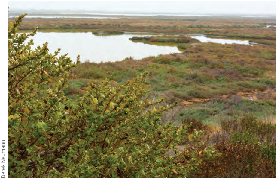
The Baylands includes the largest tidal wetland restoration project on the west coast.

The Baylands represent an opportunity for the Authority to partner with cities and public agencies that are working on the South Bay Salt Pond Restoration Project and related efforts.