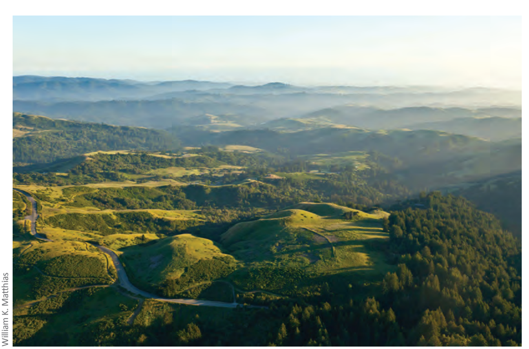
The rugged terrain and diverse habitats of the Southern Santa Cruz Mountains are among the County's most important refugia for allowing adaptation to a changing climate.

The Southern Santa Cruz Mountains Conservation Focus Area covers some of the County's most rugged terrain and diverse habitats. This area includes the eastern range of the Santa Cruz Mountains (a vast area extending from the Santa Teresa foothills in the north, south to