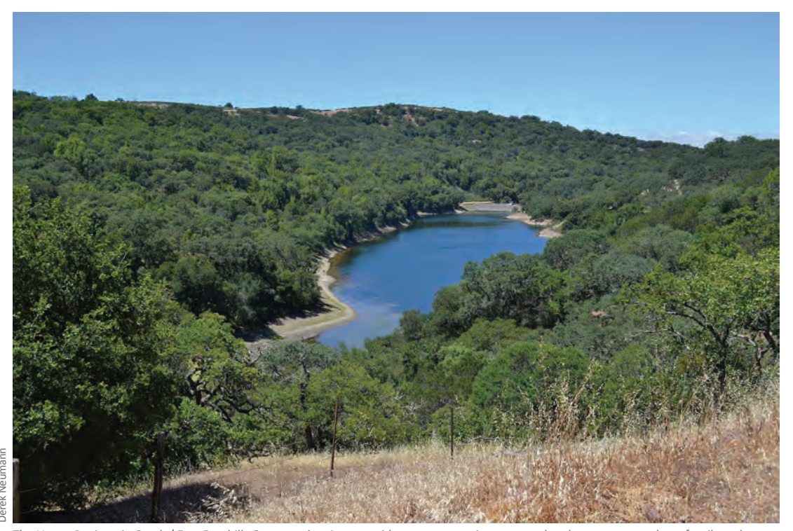
The Upper Penitencia Creek / East Foothills Conservation Area provides an opportunity to expand and connect a number of trails and open spaces, as well as to protect natural areas can reduce impacts of downstream flooding.

Located near San Jose's eastern foothills, this area rises from the valley floor to the crest of the Diablo Range. Much of this area falls within the Penitencia Creek watershed, which is characterized by rolling grasslands and oak woodlands interspersed with heavily forested canyons. The region includes a rapid transition from urban lands to some of the most rugged