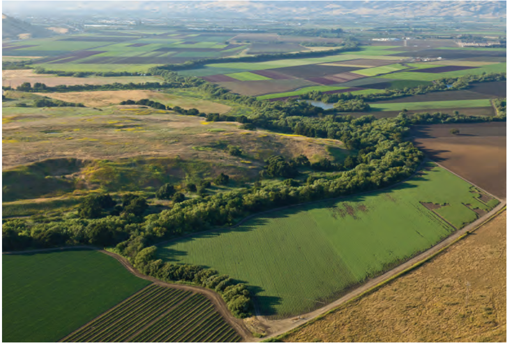
Some of the farms and ranches in the Upper Pajaro River region are part of the area's extensive floodplain, and are important for regional agriculture, flood protection, and wildlife habitat.

Because of its location at the junction of three mountain ranges, the Upper Pajaro River has been identified as a critical landscape linkage. Protection of this area is necessary to allow mountain lion, badger, and other wide-ranging animals to migrate and disperse between the extensive natural areas located in these ranges. Indeed, scientists with The Nature Conservancy estimate that protection of approximately 7,000 acres along the Upper Pajaro River will help maintain ecological connectivity to over 700,000 acres of core habitat. Land conservation along the Pajaro will be especially important to provide resilience to a changing environment. Keeping these lands intact and connected will allow plants and animals to relocate and adapt to changing environmental conditions, and will help human communities adapt by protecting an extensive floodplain and reducing impacts of downstream flooding. In addition, the Upper Pajaro provides important recreational opportunities, including a