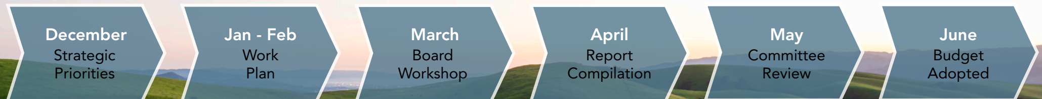
Coyote Ridge Open Space Preserve