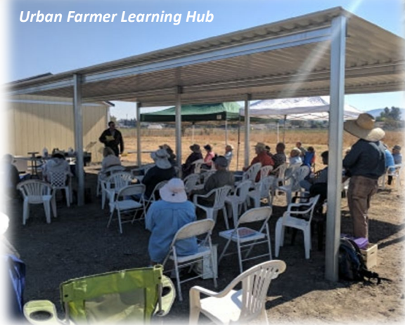
Urban Farmer Learning Hub