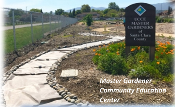
Master Gardener Community Education Center