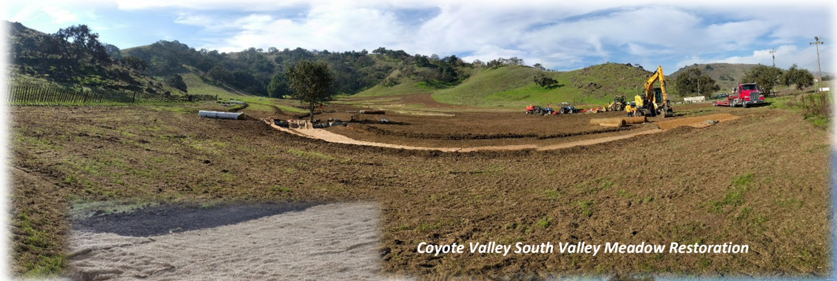
Coyote Valley South Valley Meadow Restoration

In this reported fiscal year, the Authority expended $118,632 on projects under this category.