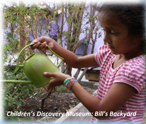
Children's Discovery Museum: Bill's Backyard

As structured by the Expenditure Plan , a grant program would be established, with monies set aside to assist municipalities, schools and applicable non-profit organizations within the cities of Milpitas, Santa Clara, San Jose, Campbell, Morgan Hill and urban County areas to create healthy and safe open space and park areas for their communities. Funds are made available through an annual grant allocation process that is subject to approval by the Authority's Governing Board of Directors.