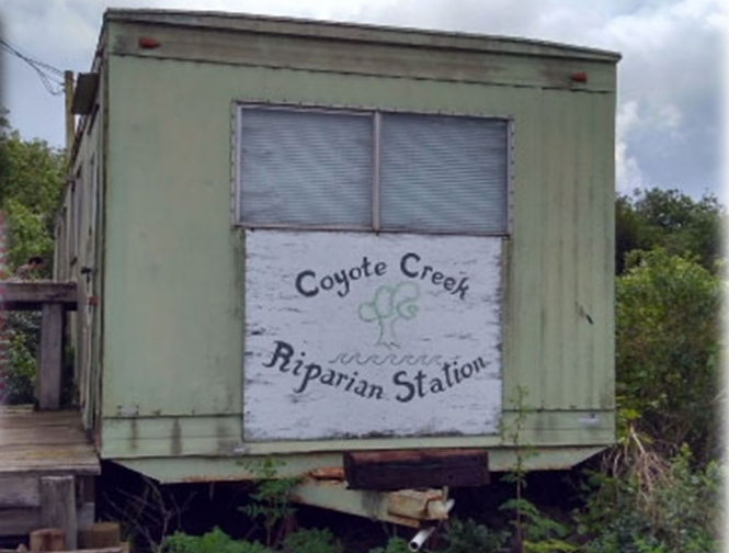
San Francisco Bay Bird Observatory Environment Education Program