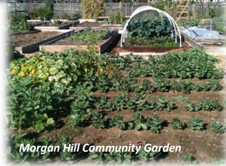
Morgan Hill Community Garden