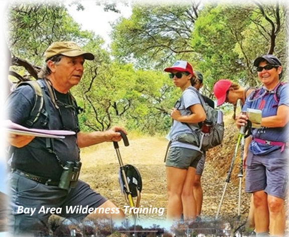
Bay Area Wilderness Training